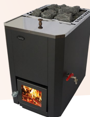
HELO R20 ES