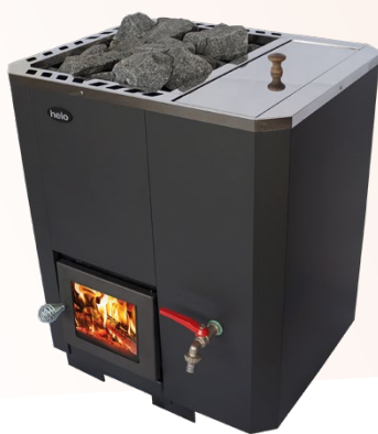
HELO R20 VO / VV